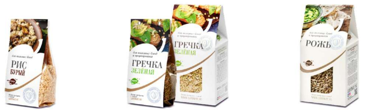
BROWN RICE 250 g shelf life: 12 months kind of packaging: film bag group packaging: 24 pieces

WIDE APPLICATION Whole grain is an ideal choice for proper nutrition recipes and sprouting. HIGH QUALITY OF GRAINS Each batch is tested for sprouting before packaging. MAXIMUM BENEFIT Whole grain retains all the vitamins, as it contains the shell and the germ.