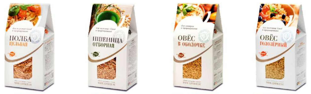
SPELT 500 g shelf life: 12 months kind of packaging: carton group packaging: 12 pieces